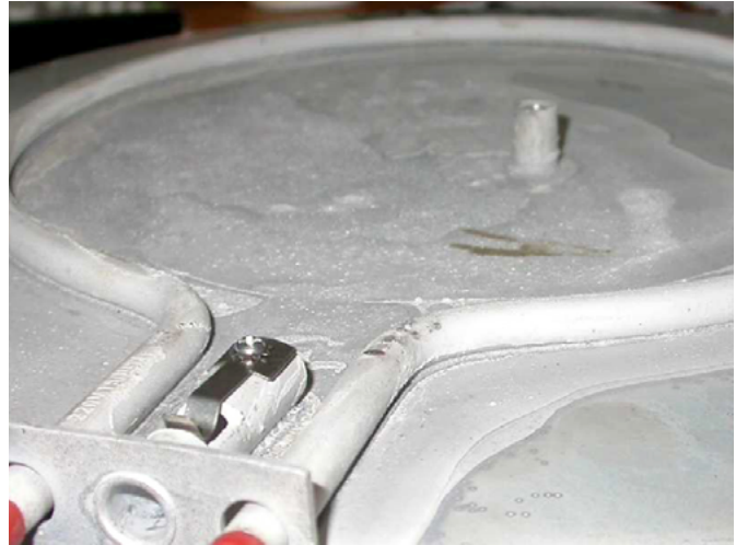
Pyro-Putty® 1000 bonds heater.