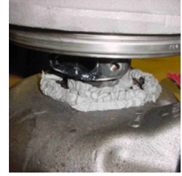
Pyro-Putty® 950 seals turbo.