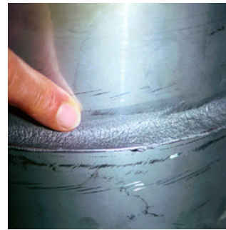
Pyro-Putty® 2400 seals high temp ducting.