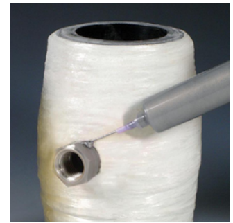
Pyro-Putty® 2400 seals high temp threads.